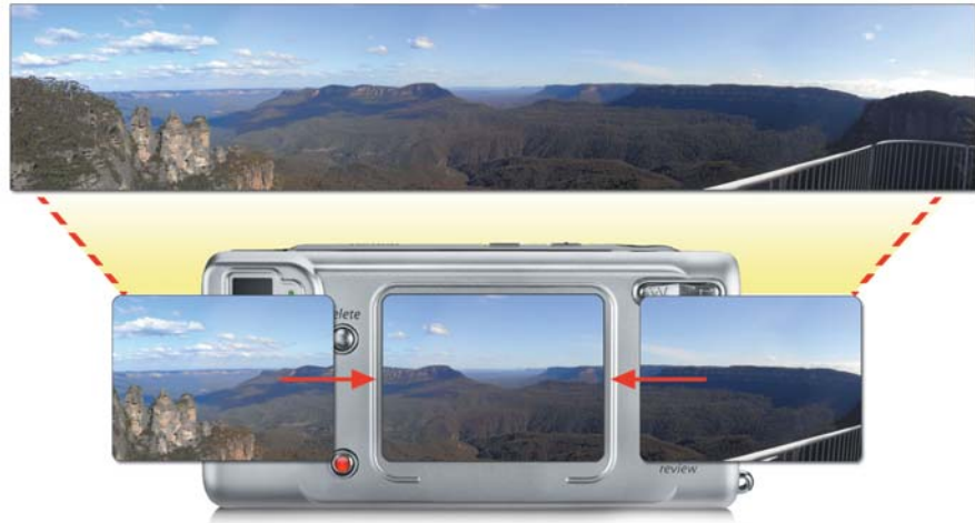
Automatic Panorama Stitching

With a decade of experience in digital multimedia technologies, ArcSoft offers embedded firmware solutions specifically for digital cameras, allowing your device to perform operations once exclusive to the PC. Your customers will save time while their overall user experience is enhanced.