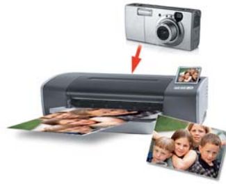
Direct Connect Printing